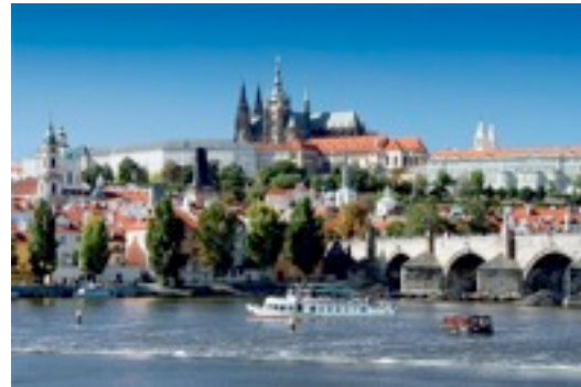
Above: right: An awesome view of the City of Prague.