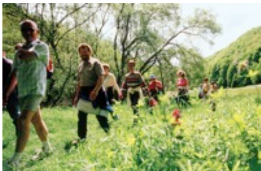
Above left: Hiking in Austria.