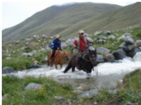
Above center: Horseback riding in Mongolia