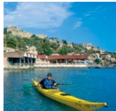
Above: Kayaking in Turkey.

Moving into 2012, we have a number of trips, some already announced on-line, others to be announced in the next few weeks: In April, 2012 we will be off to Turkey where we will start off on a traditional Turkish seafaring vessel, sailing around the Turquoise Coast of Turkey, making stops at the quaint Aegean islands along the way where we will engage in kayaking, hiking and biking. We will spend the final three days of our amazing Turkish adventure in the region around Patara where we will