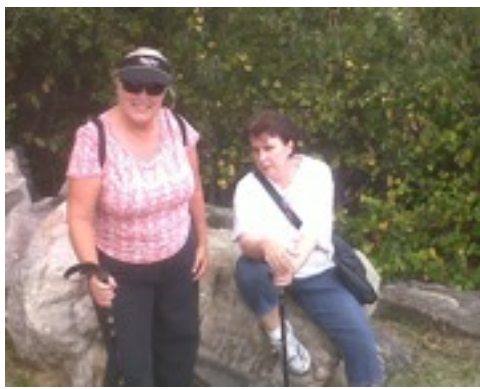
Above left: Hiking on Pine Mountain (Georgia)