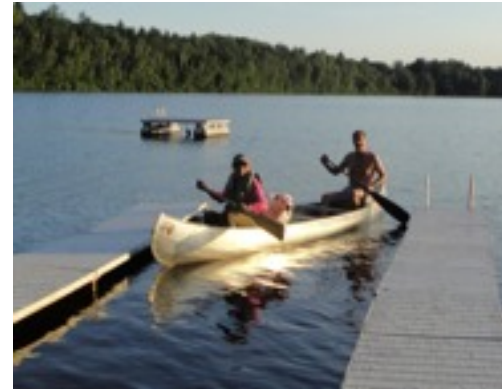
Above right: Canoeing in the Wisconsin woods.