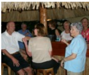
Above: Happy hour in Nicaragua.

EXPEDITIONS is adding an entirely new activity concept to the upcoming Nicaraguan holiday: yoga and healthy living culinary skills, activities that will bring a fresh new perspective to the ELDER EXPEDITIONS' experience.